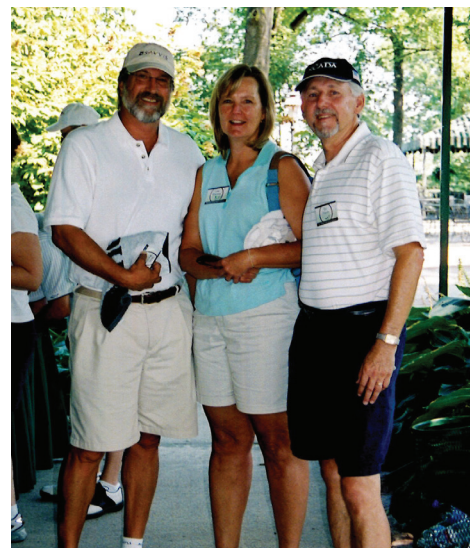
2006 NCADA Golf Tournament