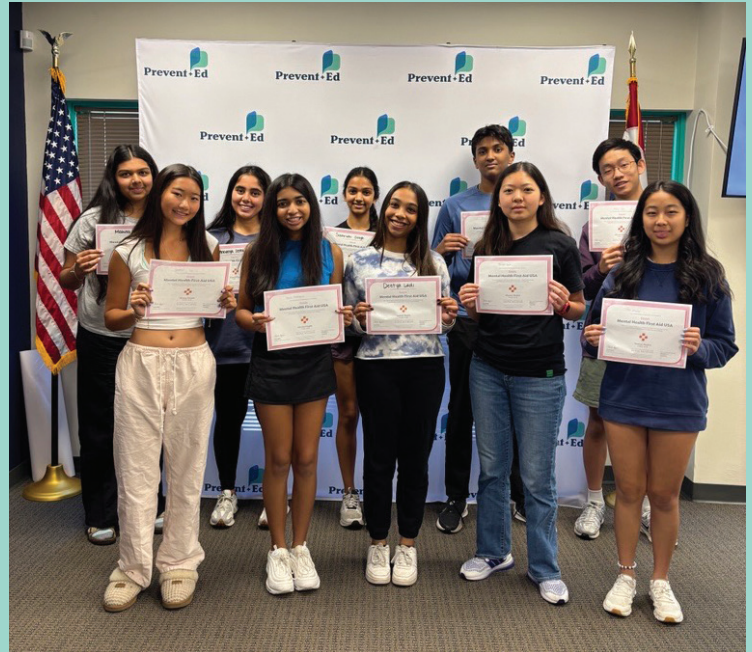
More than 100 St. Louis Asian American high school students have been certified through the tMHFA program

PreventEd was proud to be among the first organizations in the country to implement tMHFA, and we successfully trained our first cohort of 11th graders at Northwest High School in 2019 as a part the tMFHA pilot program. When PreventEd was awarded a Mental Health Awareness Training (MHAT) grant via SAMHSA in 2022, the funding was instrumental in helping PreventEd grow tMHFA programming in the St. Louis area. In the 2025-2026 school year, PreventEd has brought tMHFA to 10 schools across 5 counties in the St. Louis region, and trained approximately 3,000 students. Unfortunately, this was the same funding that was abruptly terminated without reason, along with thousands of other SAMHSA grants, in January. The loss of this funding immediately jeopardized the tMHFA programs scheduled for the Spring semester. PreventEd was then glad to learn that the decision to terminate these SAMHSA grants was quickly reversed, but the lapse certainly caused disruption and confusion for our programs and school partners.